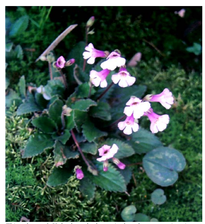
This plant of Haberlea rhodopensis has been growing in my Smyrna garden for the past five years in a protected, shady corner.

I have had these over winter for several years now in a shady and protected corner of my Zone 7a garden in Smyrna, DE. The raised bed in which they grow, while moisture retentive, offers excellent drainage. Indeed it is heat, rather than cold, which is the limiting factor with the alpine Gesneriads like Haberlea and Ramonda , which grow very well in gardens in New England.