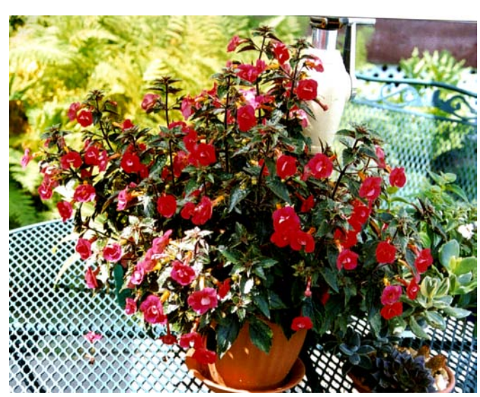
I struggled to keep the double flowered Achimenes 'Desiree' alive from year to year until I transferred it to the patio a few years ago. It filled the pot with rhizomes in one season and I have shared it with many fellow growers.

I have found that Achimenes grow luxuriously outdoors in our summers. I struggled for many years to produce satisfactory plants indoors under lights and a few years ago decided to pot them up and place them on my patio which receives full sun for much of the day. I overwinter the dormant rhizomes in their pots on my east facing sun porch under other larger plants. The temperature stays between 50-60 degrees F. for most of the winter. I currently am growing the cultivars 'Desiree,' 'Purple King,' and 'Double Blue Rose.' This year I am planning to add a few more!