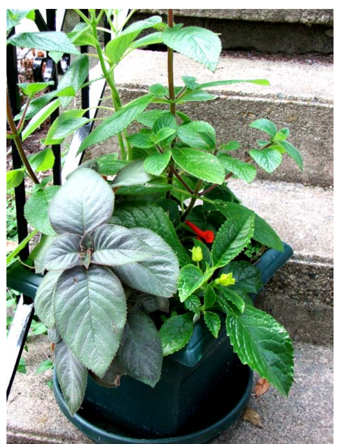
Karyn Cichocki's planters contained an assortment of plants including Kohleria, Sinningia and Chrysothemis. Karyn lives in Lafayette, NJ.

Tender gesneriads thrive in planters outdoors from late spring to early autumn and can be used to add interest to decks and patios. Indeed, this may be the easiest (and least expensive) way to extend you collection without the need for additional light stands or crowded windowsills. One friend, Karyn Cichocki, has grown stunning containers of mixed gesneriads.