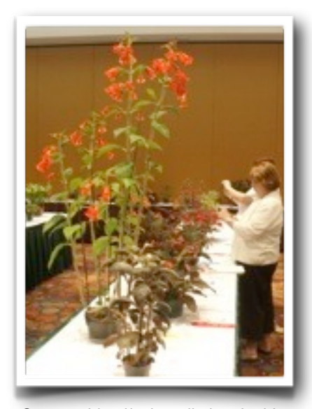
Can you identify the tall plant in this photo? If not, see the next issue.