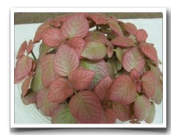
Episcia 'Thad's Pink Flamingo'

I grow all my Episcias uncovered except for the pinks such as Episcia 'Unpredictable Helen', Episcia 'Unpredictable Valley', and Episcia 'Cleopatra'. However, I do grow Episcia 'Pink Smoke' uncovered and it does great. I use my standard AV mix — peat moss, vermiculite, perlite (1-1-1) with a little dolomite lime and charcoal. I use the same fertilizers that are given to my African Violets. I rotate DynaGro (1/2 tsp. to a gallon of water), Jack's Bloom Booster 10/30/10 (1/4 tsp to a gallon of water), Eleanor's VF-11 (4 capfuls to a gallon of