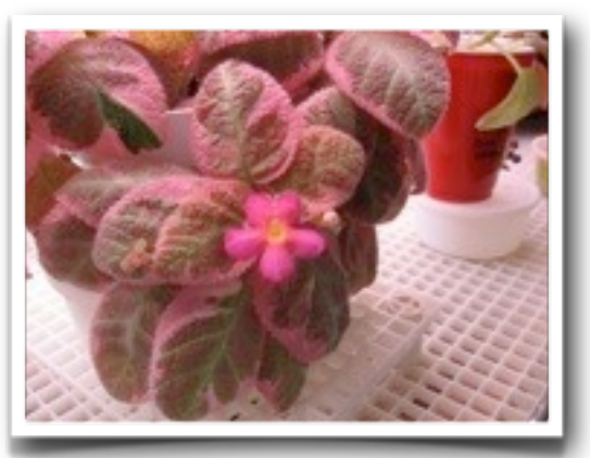
Episcia 'Pink Smoke'

water), and Urea-free Orchid Fertilizer 20/10/20 (1/4 tsp to a gallon of water). I use distilled water adding 10 drops of "pH Up" per gallon.