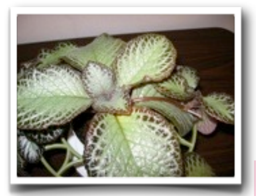
Unnamed Betty Cessna hybrid

proper water absorption. By removing the extra stolons (beyond 3 or 4) and the flowers, I have larger foliage with better coloration. I certainly enjoy growing Episcias and especially love those recently developed by Thad Scaggs and Betty Cessna.