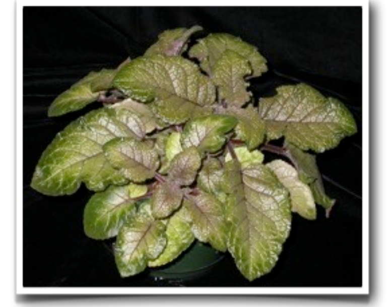
Sinningia 'Peridots Bubbling Butter'