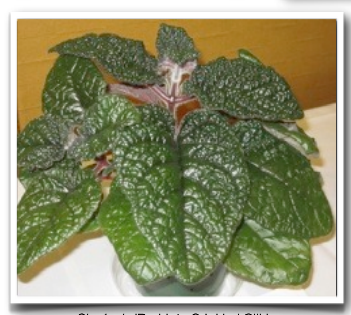
Sinningia 'Peridots Crinkled Silk'