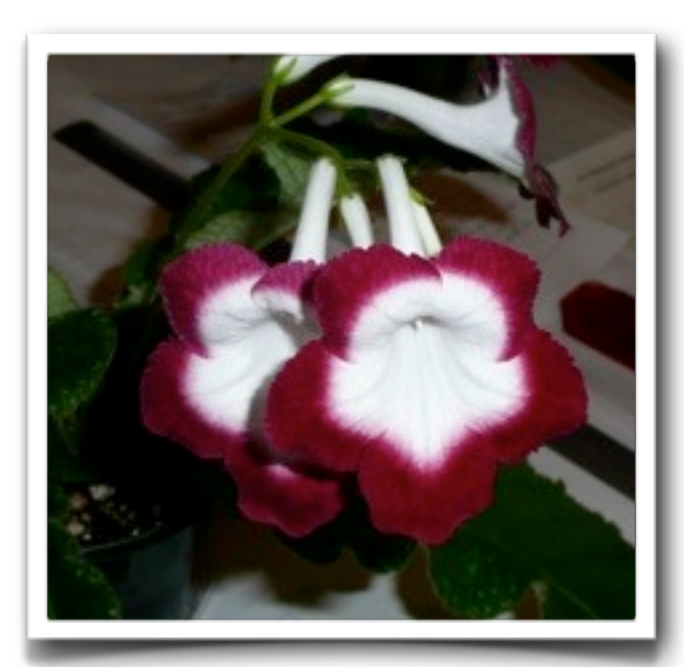
Streptocarpus 'Blue Mars' and Streptocarpus 'Fleischle Roulette Cherry' exhibited by Ken Li