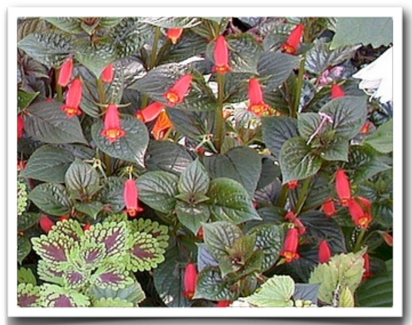
Seemannia 'Red Prince'

'Purple Prince' and S. nematanthodes 'Evita' are superior versions of the species. The new F1 hybrid likewise had much better form and foliage than the previous F1 hybrid that I had used to produce S. 'Big Red' and S. 'Little Red'. S. 'Red Prince' has very dark, glossy foliage and deep red flowers. It's very similar to the other two hybrids but I have used it in further breeding and decided it was nice enough in its own right to name.