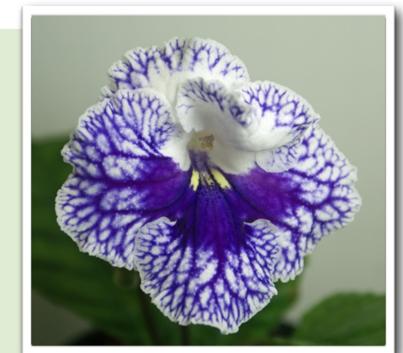
Streptocarpus 'Victorian Lace'