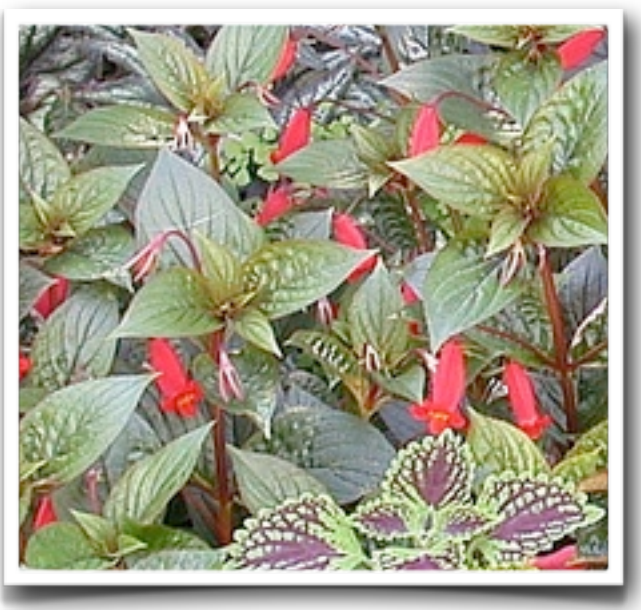
Seemannia 'Big Red'

Seemannia purpurascens 'Purple Prince' was my first Seemannia hybrid, resulting from a cross between two different wild collections of the species. S. 'Purple Prince' is a tall, dark-leafed hybrid with pink flowers with a contrasting green limb. Although pinching helps keep it compact, it ultimately gets too tall for growing indoors but performs very well outdoors in containers or in the ground where it has plenty of head room. Inspired by my success with this plant, and intrigued by the reputed hardiness of S. nematanthodes, I have made crosses between these two species in hopes of producing hybrids with attractive foliage that are also hardy. In this I have been at least half successful and have recently released three