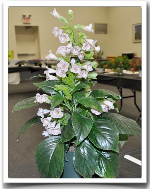
Sinningia guttata