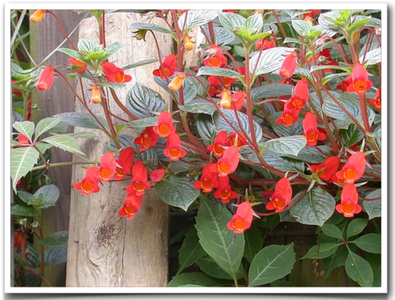
Seemannia nematanthodes 'Evita'

dappled shade but will stay more compact and bloom better if they get direct sun for part of the day, preferably in the morning. S. nematanthodes and its hybrids, in