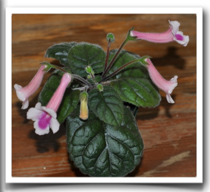
Sinningia 'Powder Puff' - Esperanza Kesler