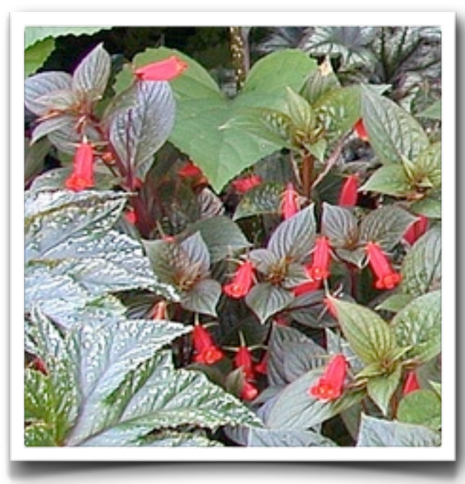
Seemannia 'LIttle Red'

new cultivars from these crosses that combine dark foliage with bright red flowers.