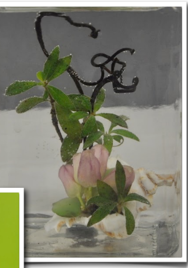
Design - Saltwater Taffy — Ben Paternoster