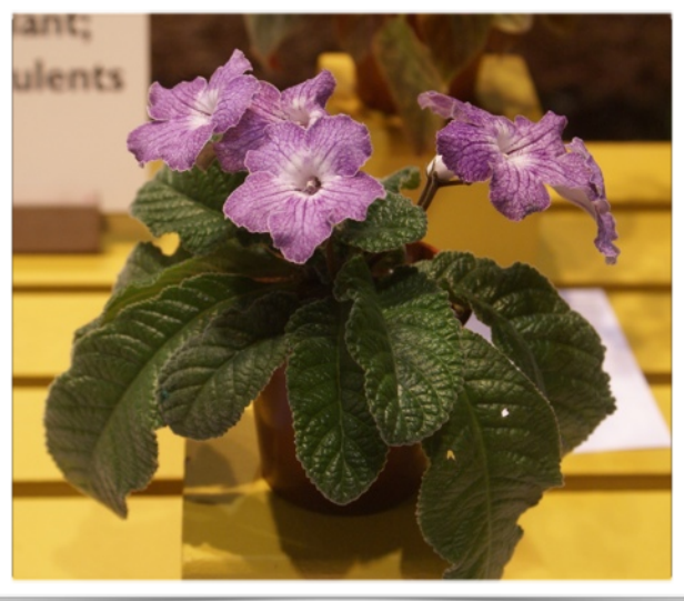
Streptocarpus 'Russ' Blue' - Russell Strover