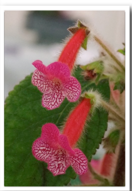
Kohleria 'Connecticut Belle'