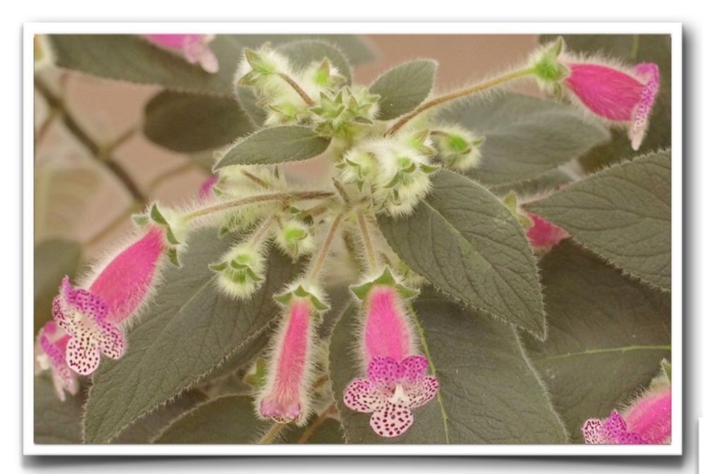
Kohleria 'Keystone's Morning Frost' — Brett Flewelling