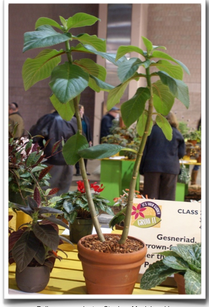
Paliavana prasinata