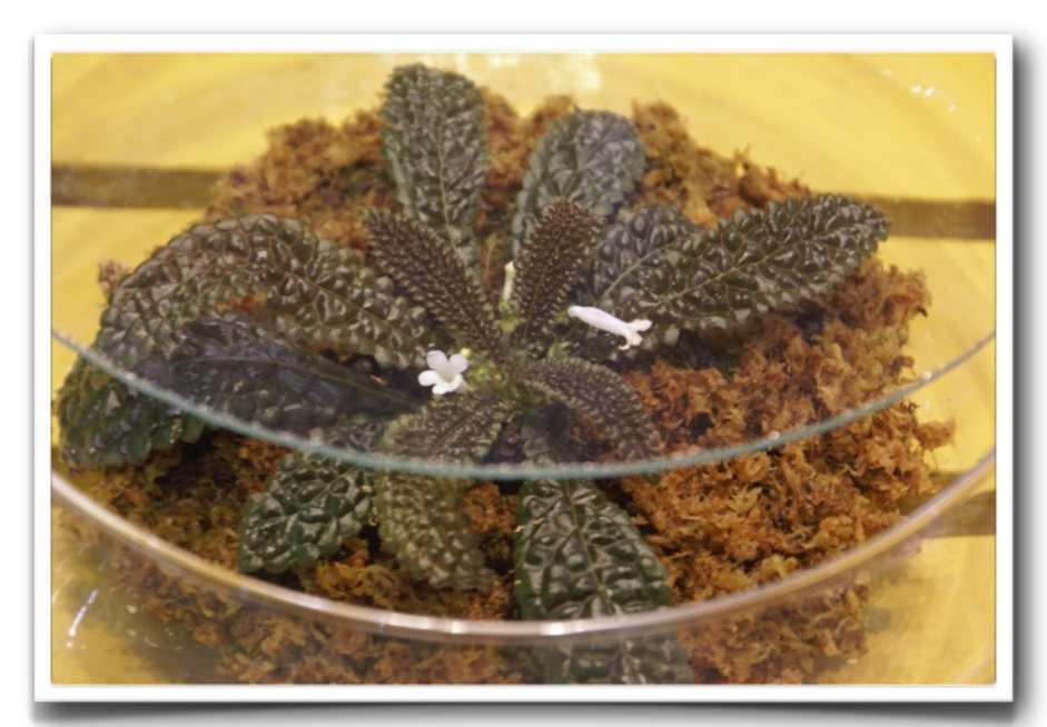
Nautilocalyx pemphidius