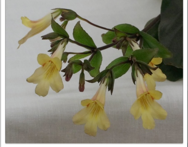
Primulina 'Aiko' (Red)