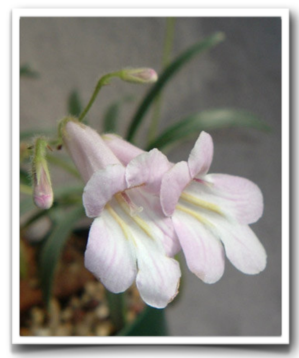
Primulina linearifolia, formerly Chirita linearifolia (grown and photographed by Karyn Cichocki)