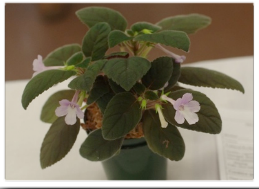
Sinningia 'Paper Moon' — Brett Flewelling