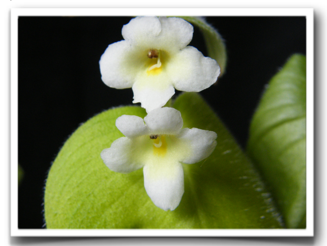
Microchirita hamosa, formerly Chirita hamosa