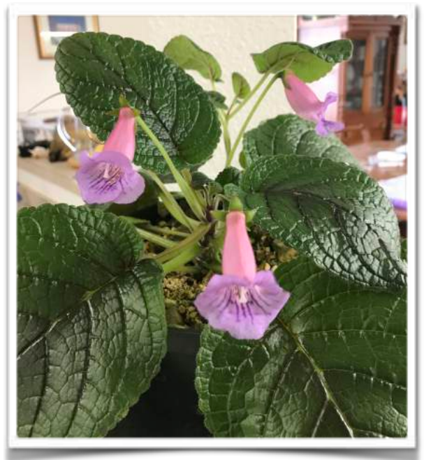
Sinningia 'Prima Donna'