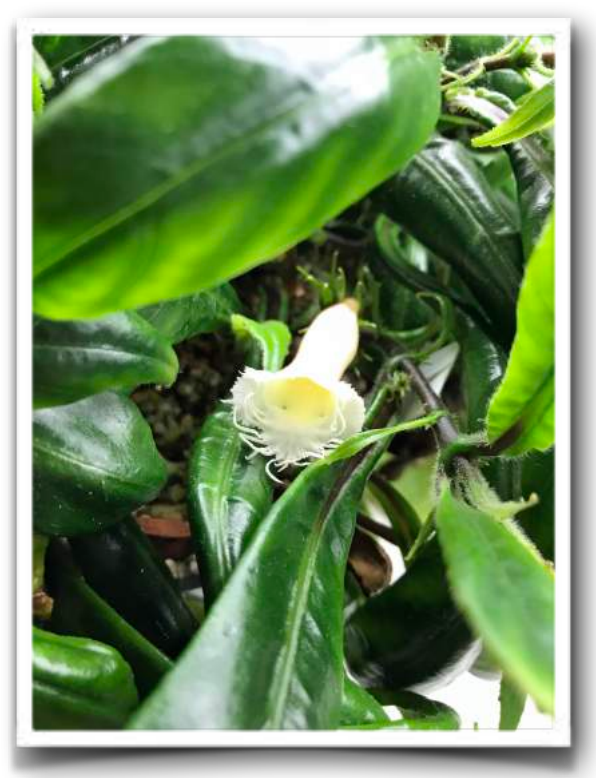
Paradrymonia ciliosa blooming on the bottom shelf (right)