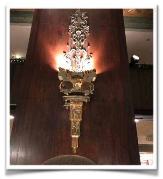
The beautiful Hilton Netherland Plaza Hotel, a masterpiece of 1930's French art deco design, will be our home base in Cincinnati for the convention.

Cincinnati is located within 500 miles of 60% of the nation's population. A one day's drive for many people. The electric trolley on the right, Cincinnati Bell Connector, makes it easy to visit most of the sights you will want to see in the city.