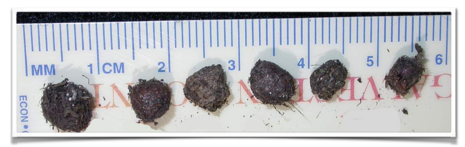
May 18, 2018: To be honest, I wasn't sure if these were really tubers or just hard pieces of soil.