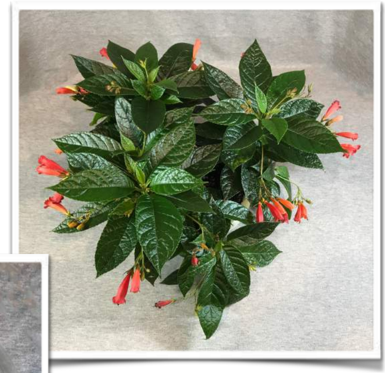
Episcia 'Moonlight Valley' Penny Wichman