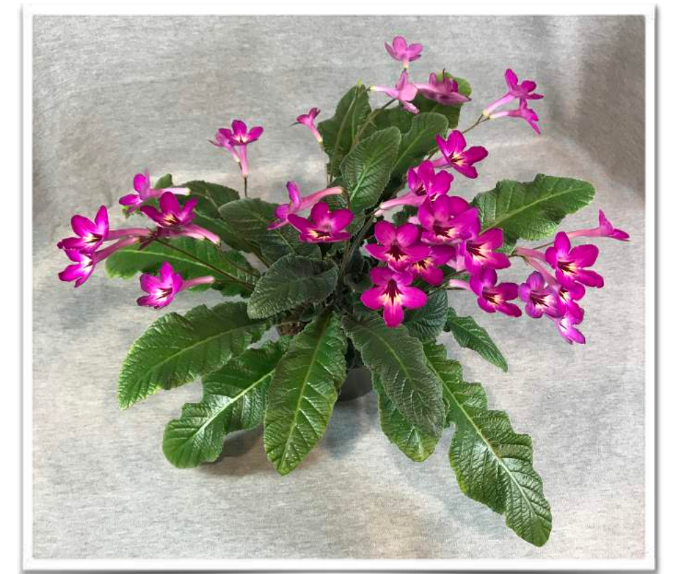
Episcia (Belize collection) Paul Kroll