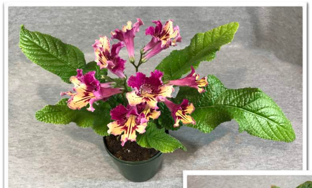
Streptocarpus 'Fred's Yellow Wine' Terri Vicenzi