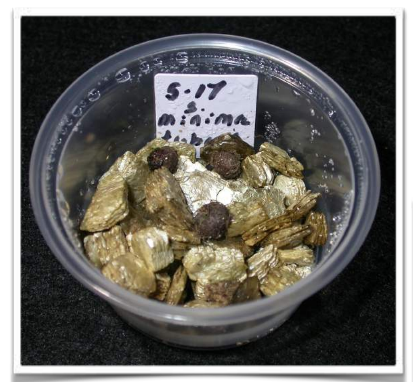
August 24, 2018: I was thrilled to see that four of the tubers sprouted after 14 weeks in the moist vermiculite!

May 18, 2018: I consulted with Mauro who cautioned that I not allow the tubers to completely dry. I added moistened, large chunks of vermiculite to a small container along with the tubers and put a lid on the container. I kept the container on the shelf of my stand so it got the LED lights during the daytime.