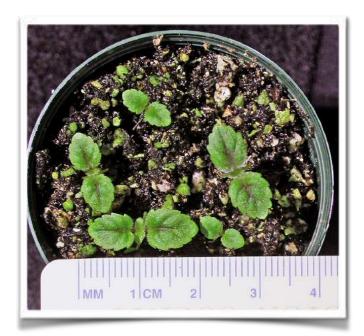
December 26, 2017: See how quickly seedlings grow when transplanted!

"Terrarium is a good idea because they grow in places that have dripping water all the time during the growing season. It grows at 700 meters of altitude (about 2100 feet), but what really differs it from the other miniatures is the dry/wet period. The place is very dry for at least six months. August/ September are the driest months. It does not have much to do with temperature or day length because it is close to Equator line 6 degrees 2'22.97" S50 degrees 17' 25.94W. The rainy season starts in November and in February the sinningias are in full bloom." In my home they came back in October, started blooming in November and