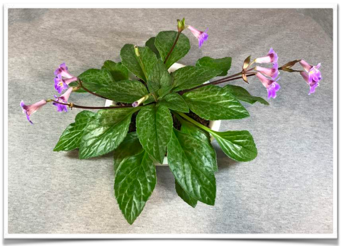
Primulina 'Moonlight' - Mel Grice