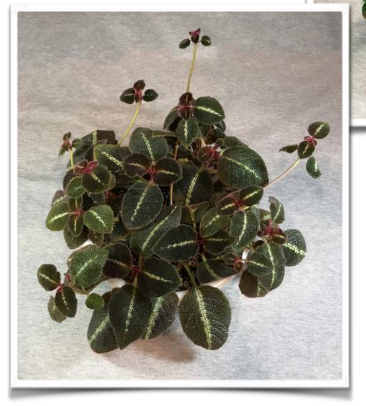
Episcia cupreata 'La Soledad Bronze' Paul Kroll