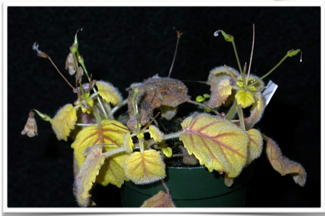
May 13, 2018: The plant was in significant decline, going dormant. I waited until the seedpods were dried before looking for tubers.