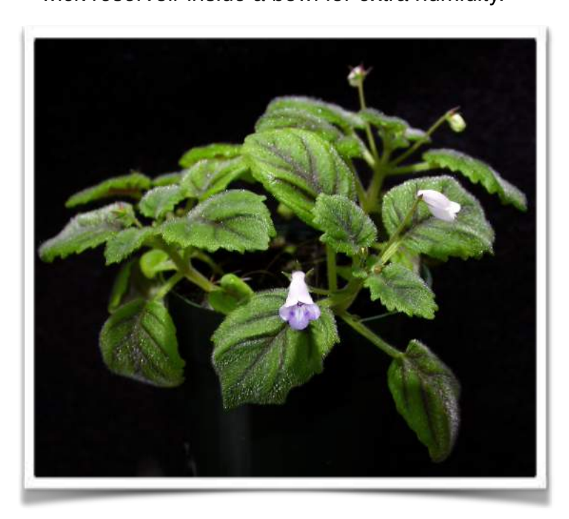
February 17, 2018: First flowers bloomed. Initially I was hand pollinating the flowers to make sure I got seeds, but this little species self-pollinates.