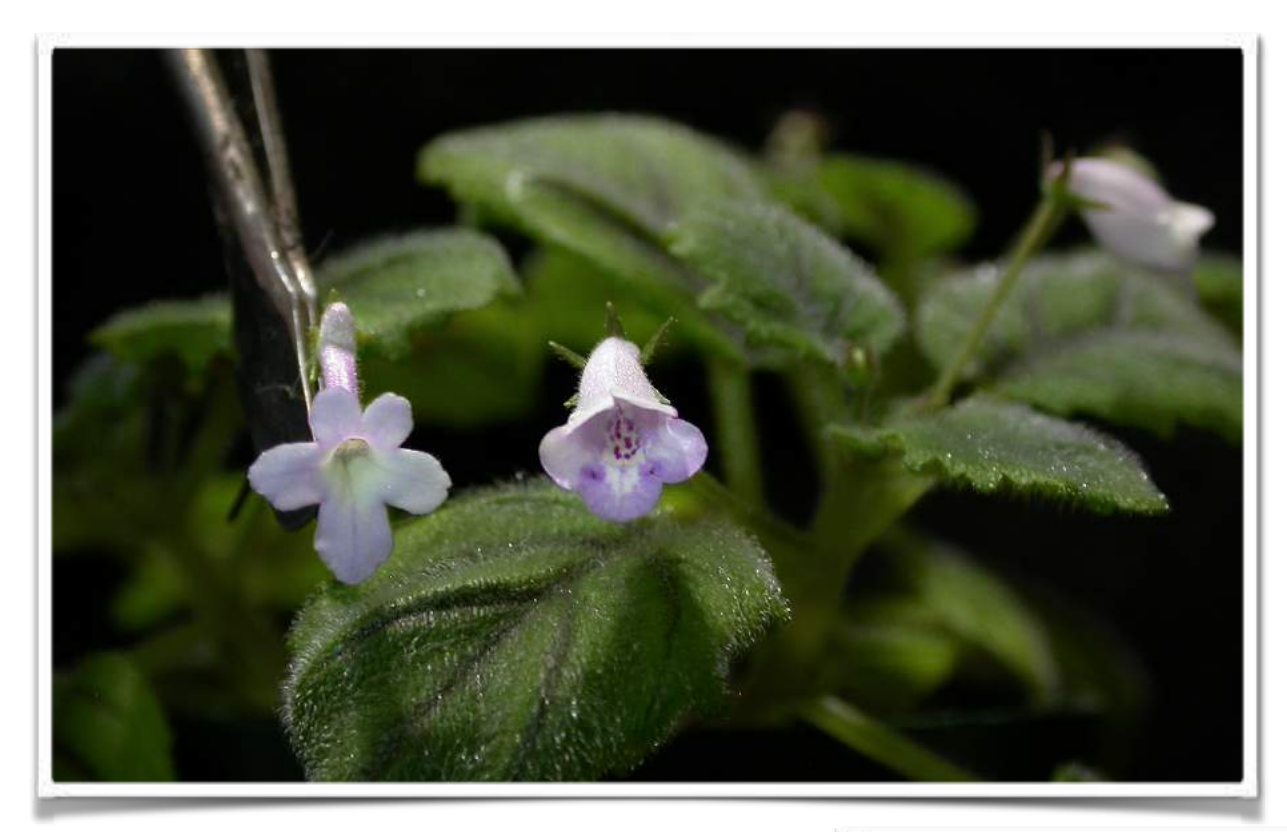
Sinningia pusilla is on the left and Sinningia minima is on the right.