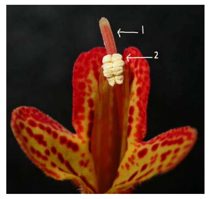
Above, #1 shows the style and stigma before it matures. #2 shows the powdery pollen on the anther. Note the pollen is facing away from the female organs so there is no self-fertilization.