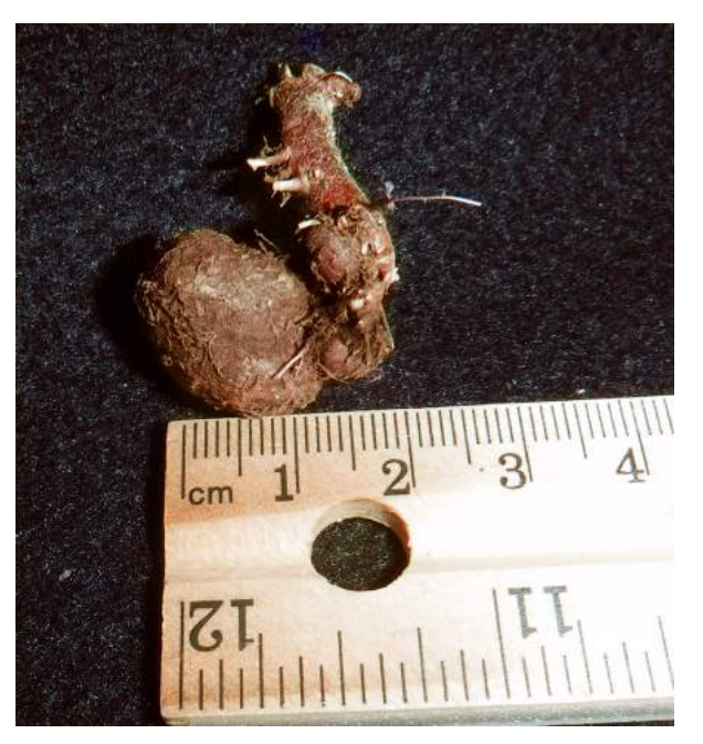
By the end of December 2018, I harvested the tuber, which will be kept for the next 6 to 7 months in barely moist vermiculite.