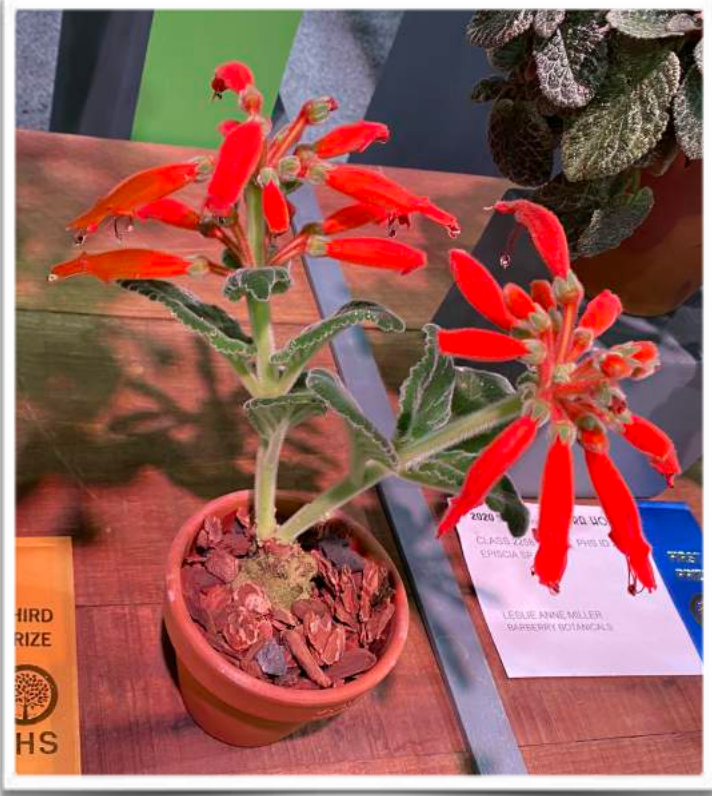
Sinningia cardinalis