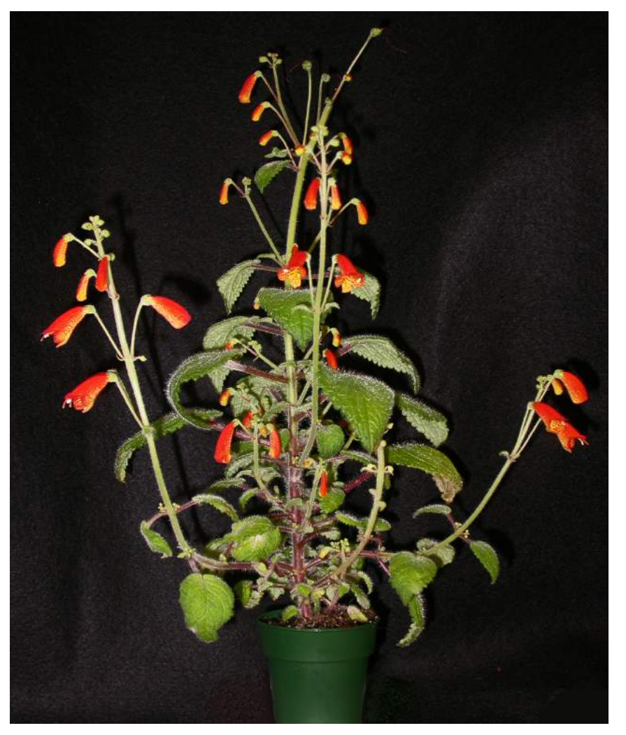
By November 12, 2018, shoots in the axils began to bloom