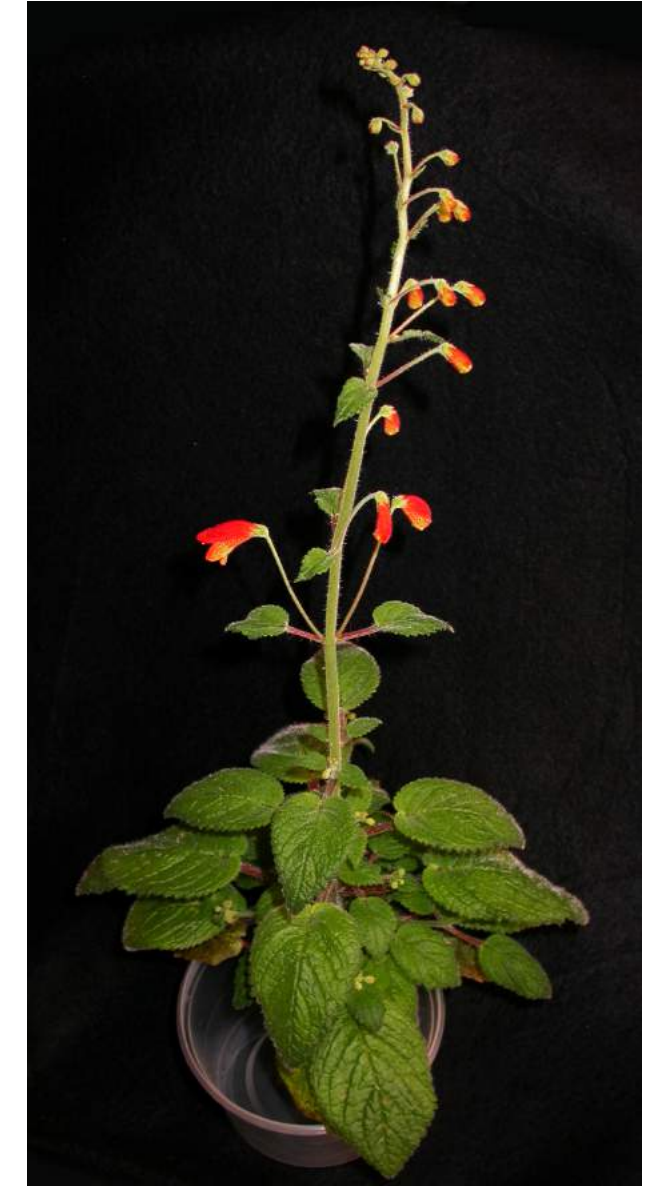
As of October 26, 2018, I had acclimated the plant to room air and the inflorescence began to bloom.

Reference: The GLOXINIAN, 2Q 2000, Vol. 50, No. 2, pp. 18-21.