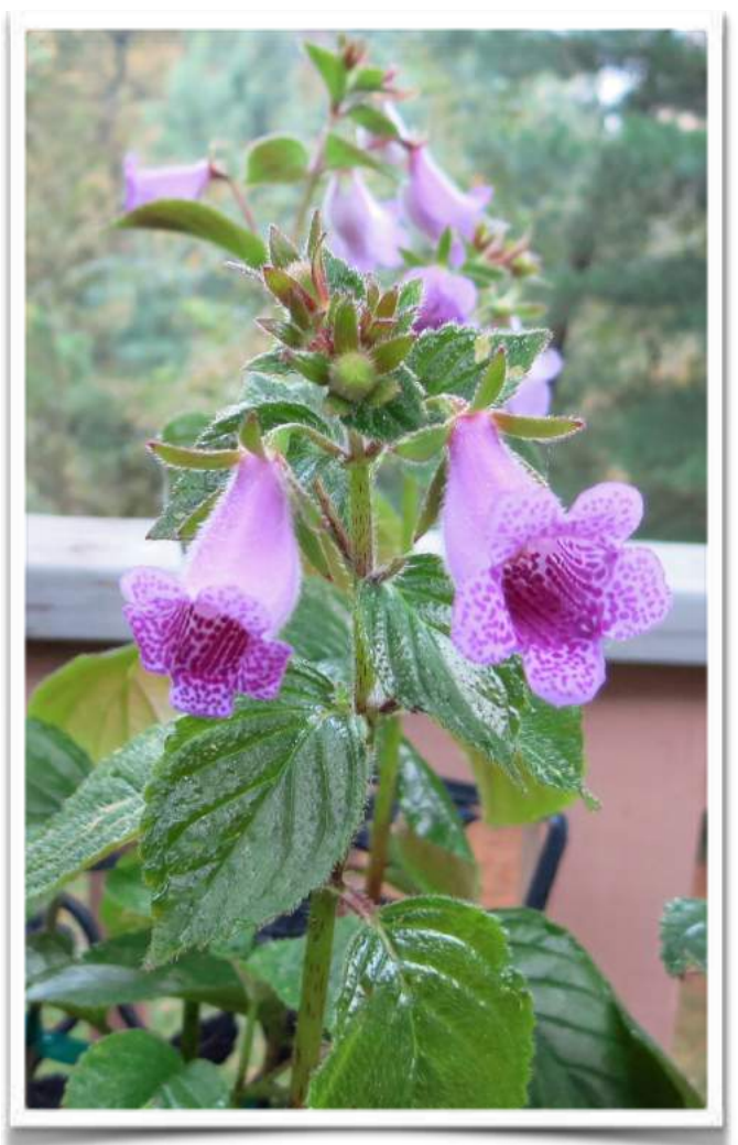
×Gloximannia 'She's Dancing'