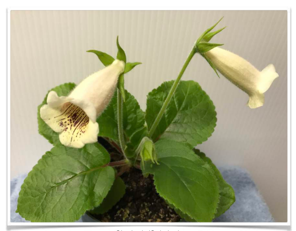
Sinningia 'Solstice'