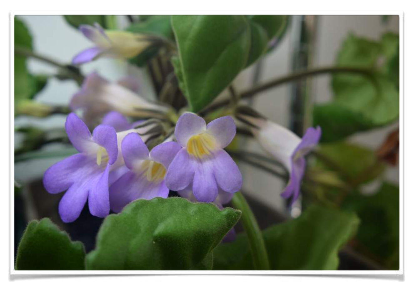
Primulina cordata