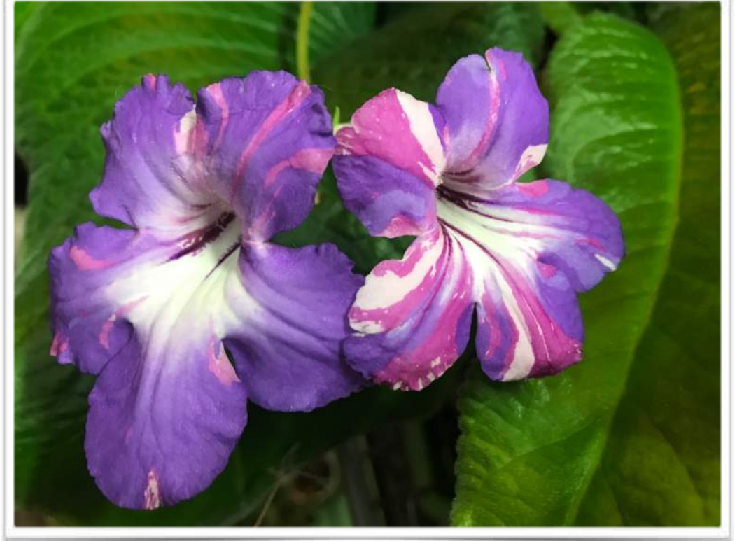
Streptocarpus 'Bristol's Party Boy'