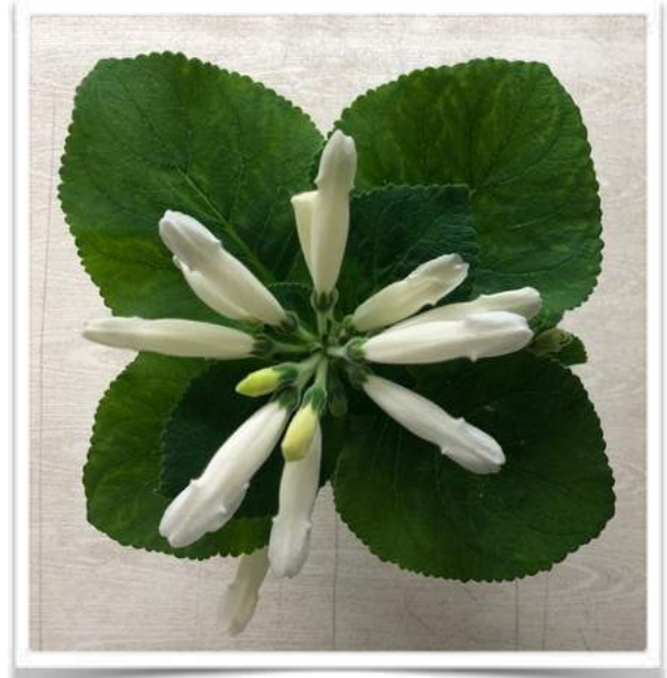
Sinningia cardinalis 'Innocent'