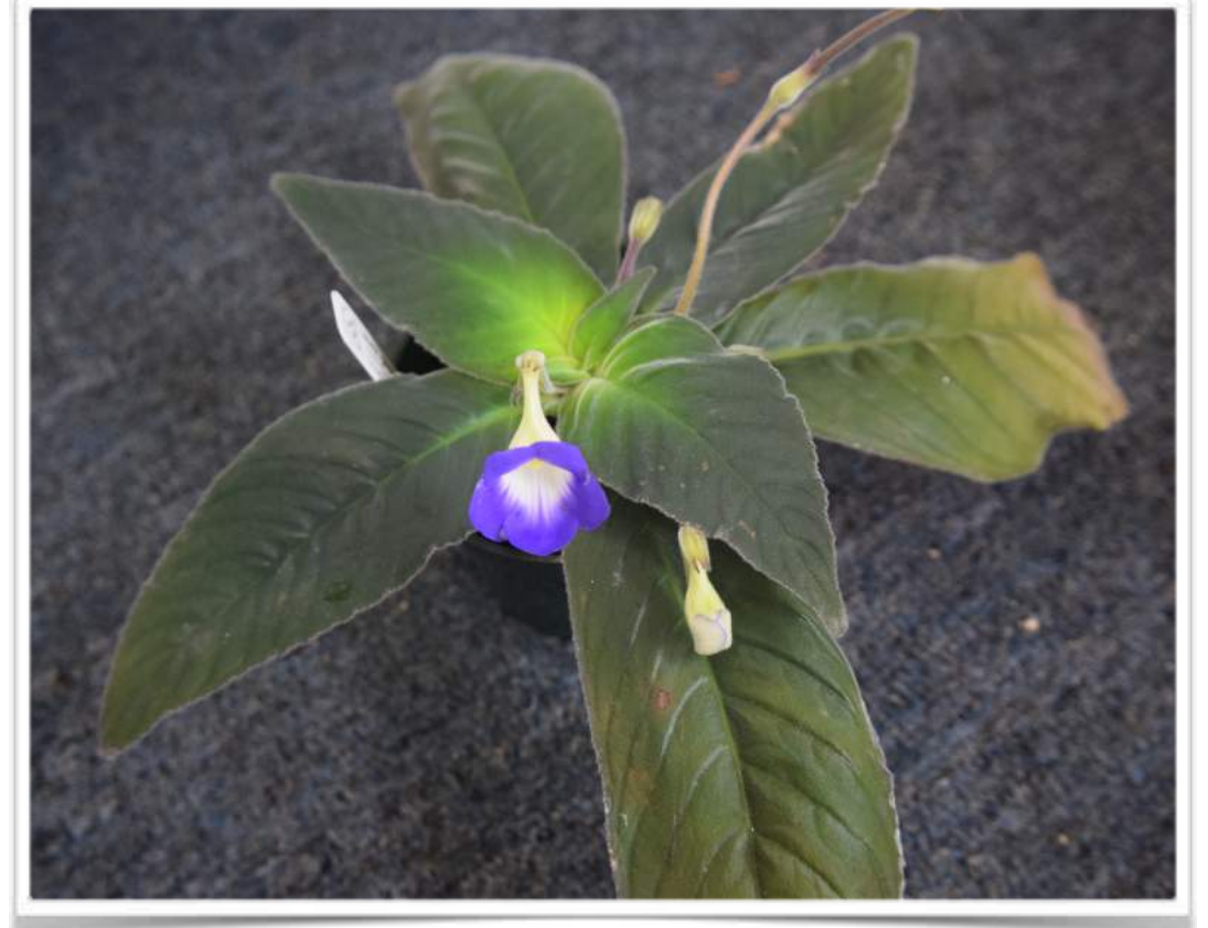
Microchirita mollisima