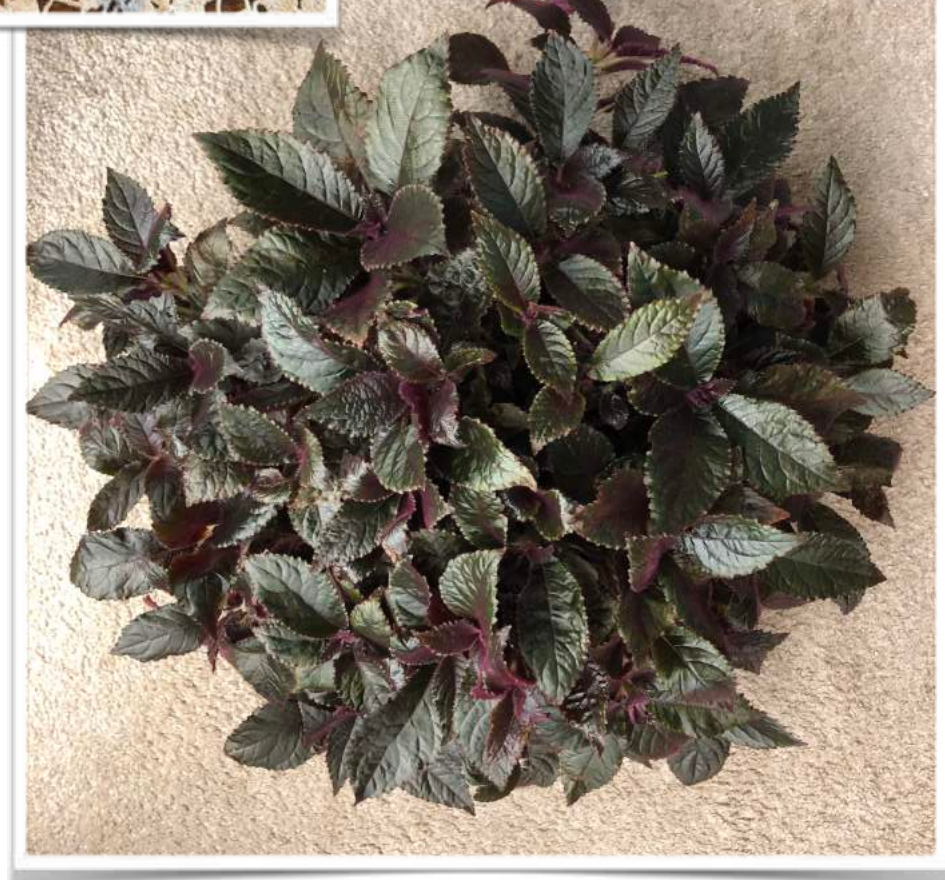
Nautilocalyx glandulifer