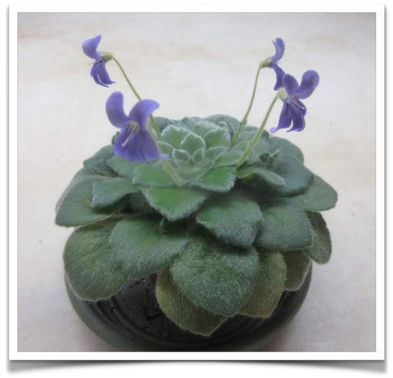
Microchirita mollissima Wallace Wells "Very challenging to grow. What works is low light and high humidity"