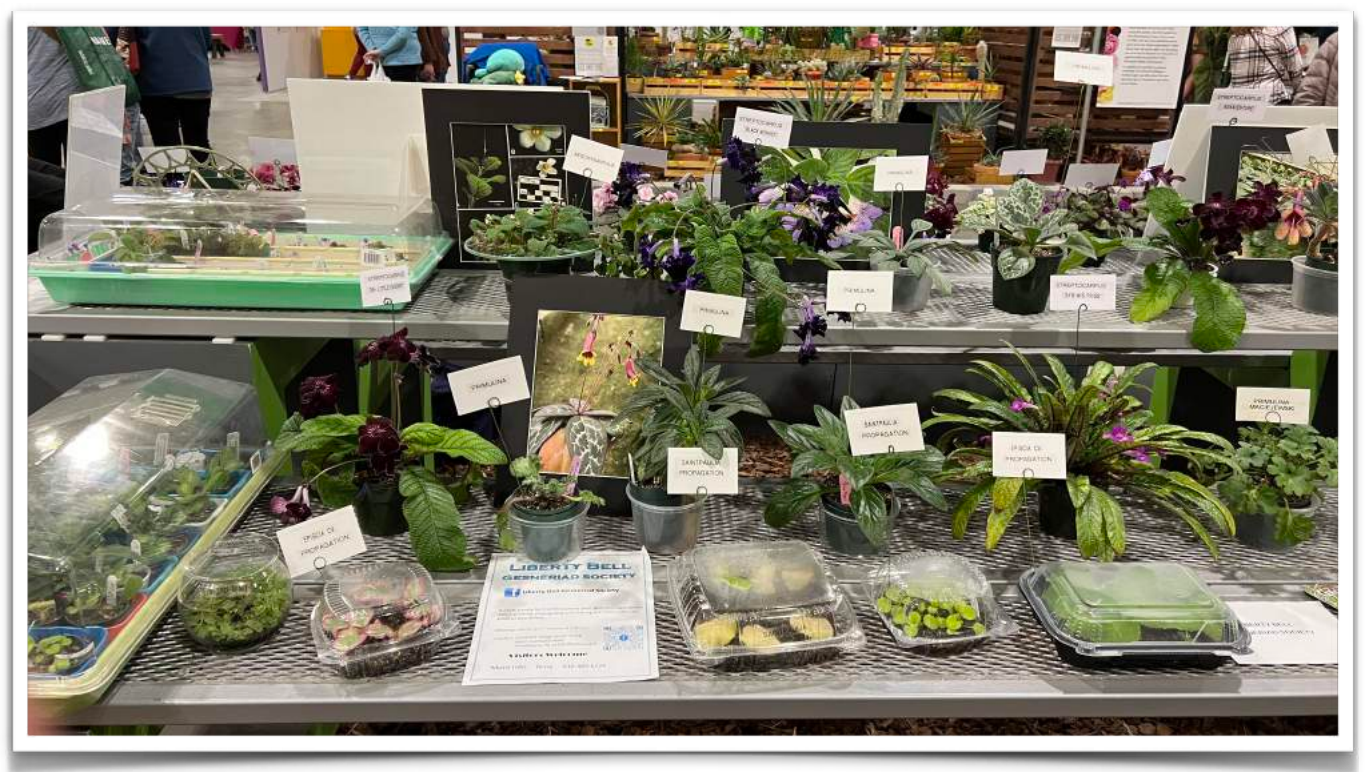
Liberty Bell Gesneriad Society display table