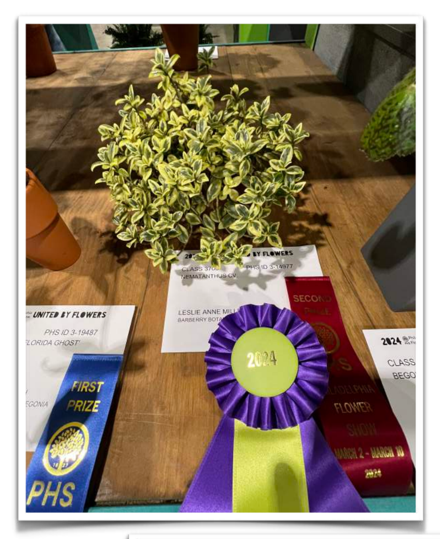
Nematanthus cv. Leslie Anne Miller

*Note - many exhibitors in this show just put the species name and cv. (for cultivar) when they lose the hybrid name.