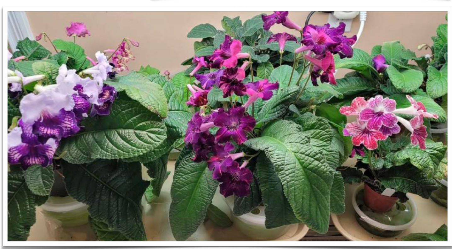
Streptocarpus plants on Terri Vicenzi's light stand