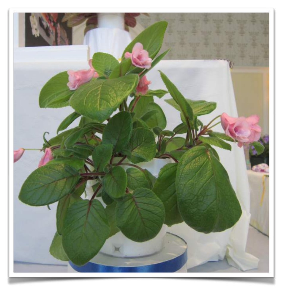
Sinningia 'Party Dress' Bill Schmidt