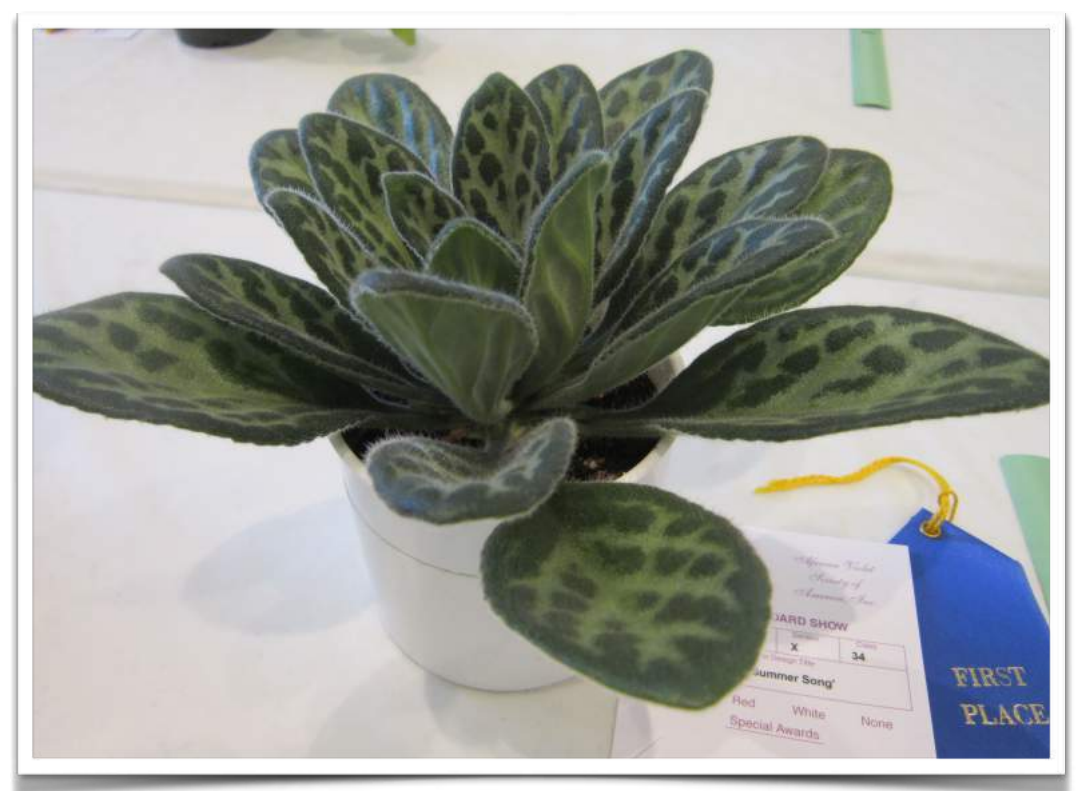
Primulina 'Summer Song' - Kitty Hedgepeth