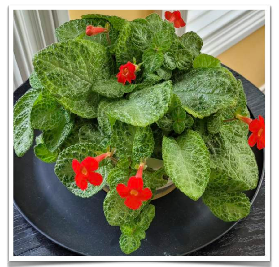
Episcia 'Faded Jade'