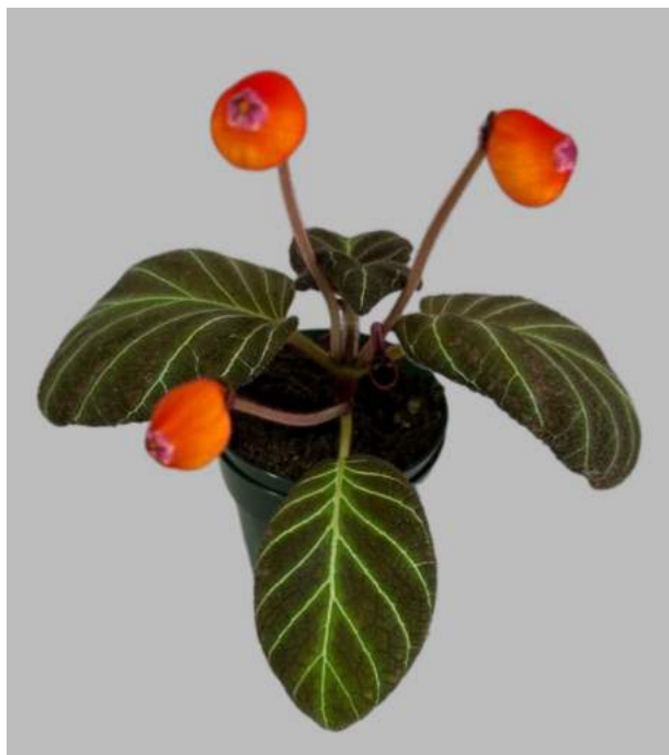
Pearcea hypocyrtiflora