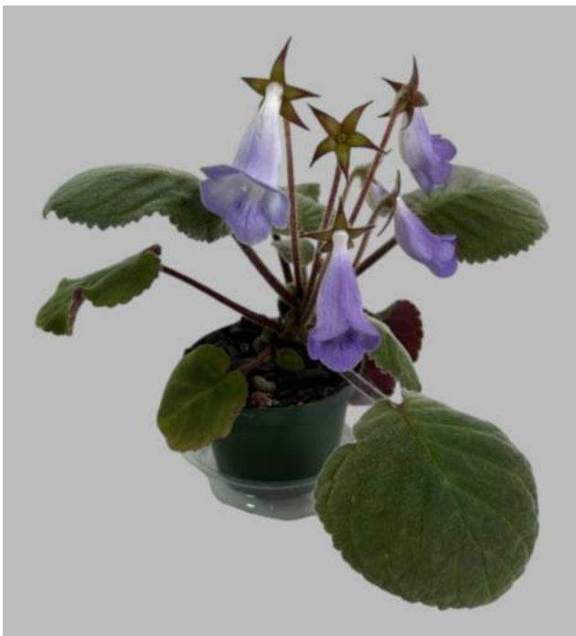
Sinningia speciosa 'Poco Purado'