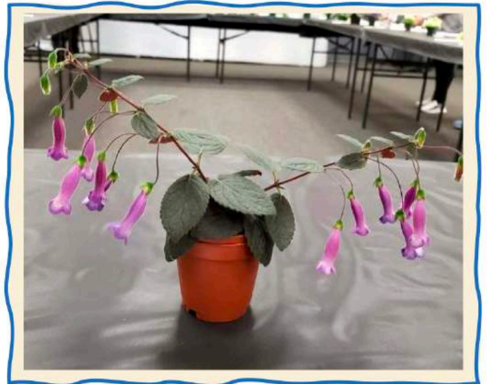
Sinningia 'Deep Purple Dreaming'