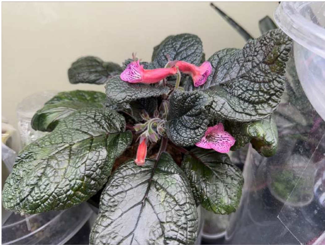
Sinningia 'Romanza' Wallace Wells