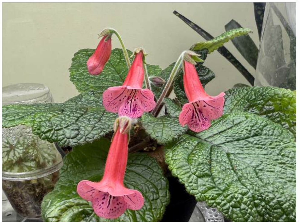
Sinningia 'Judy Becker' Wallace Wells