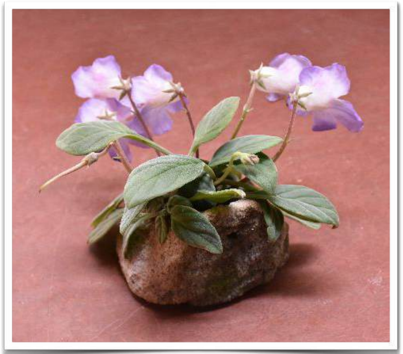
Primulina baishouensis