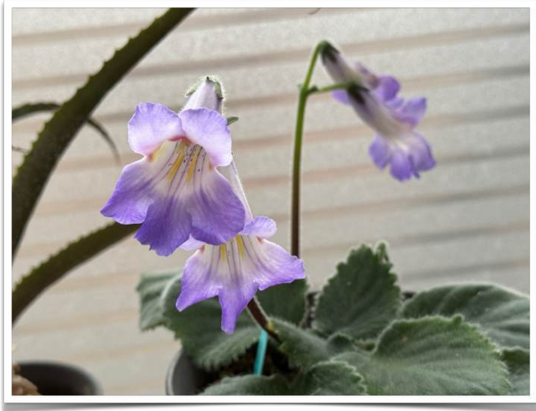
Primulina 'Atsuko' Wallace Wells