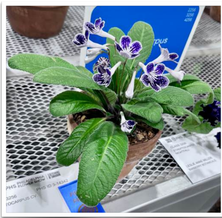
Streptocarpus cv. Effie Wister