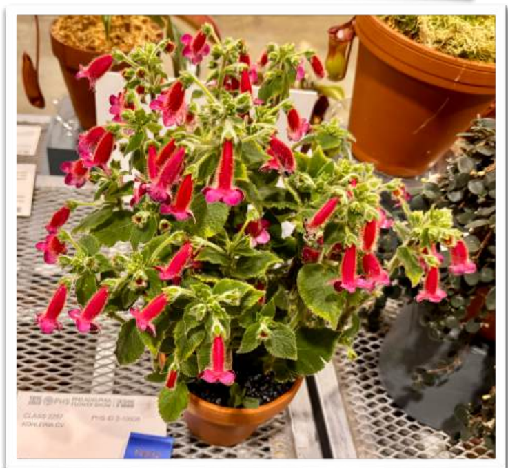
Kohleria cv. Leslie Anne Miller

*Note - many exhibitors in this show just put the species name and cv. (for cultivar) when they lose the hybrid name.