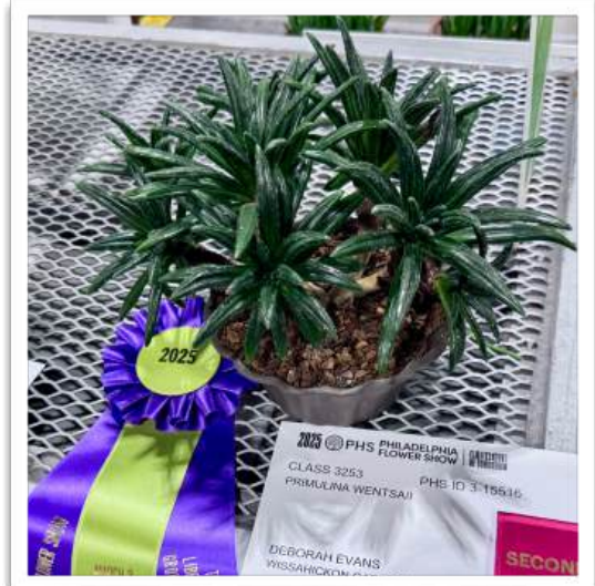
Primulina wentsaii received The Liberty Bell Award on another judging day.