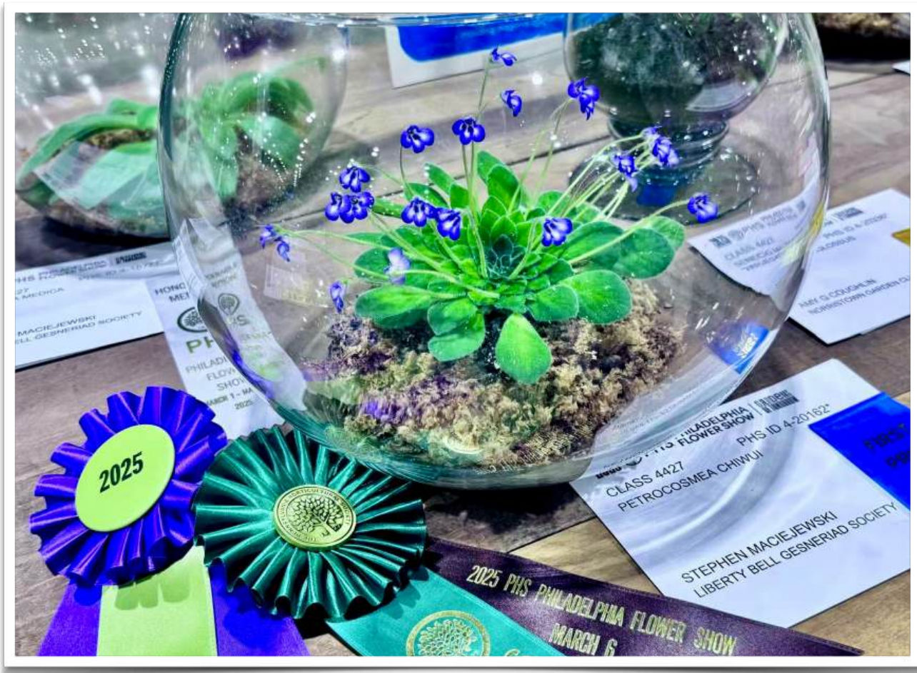
Petrocosmea chiwui