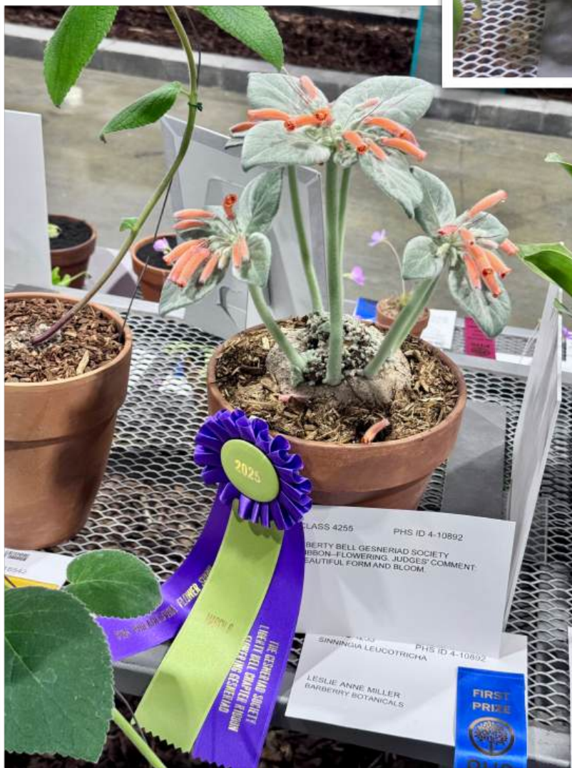
Sinningia leucotricha