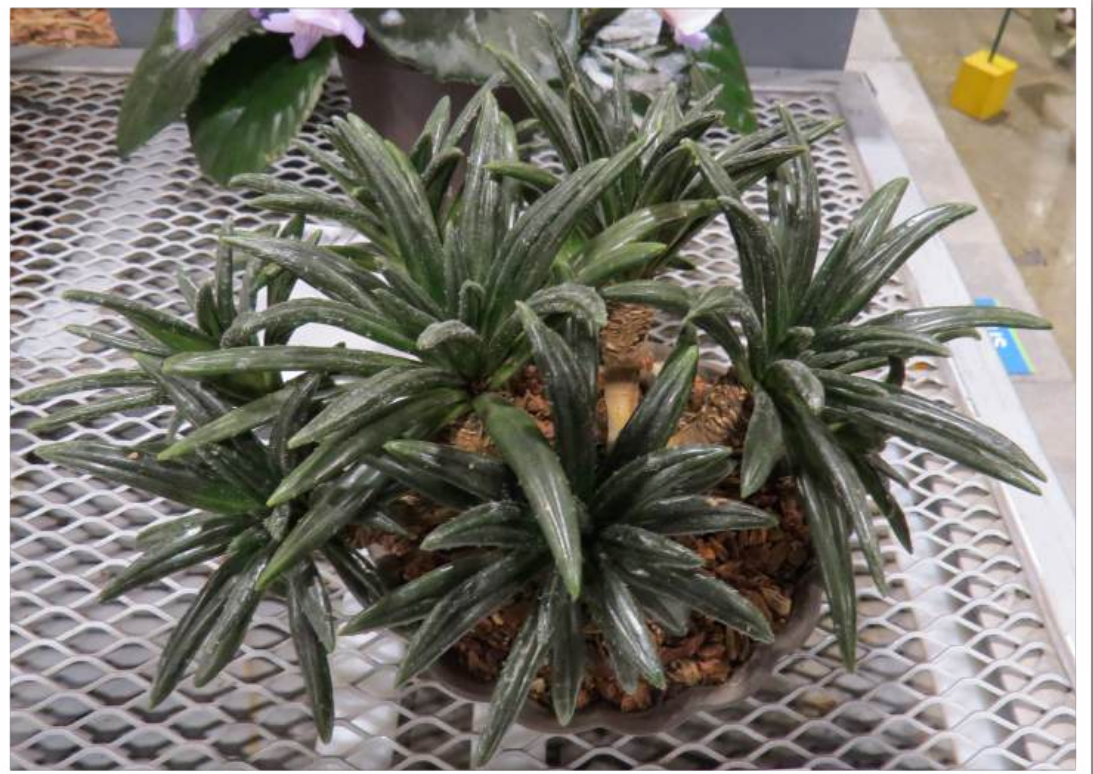
Primulina wentsaii