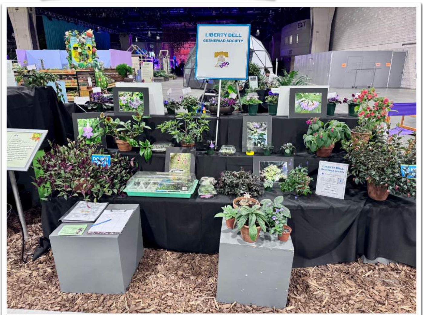
Liberty Bell Gesneriad Society Display