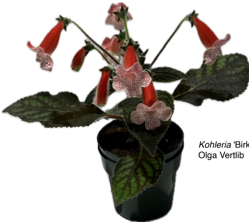
Kohleria 'Birka' Olga Vertlib