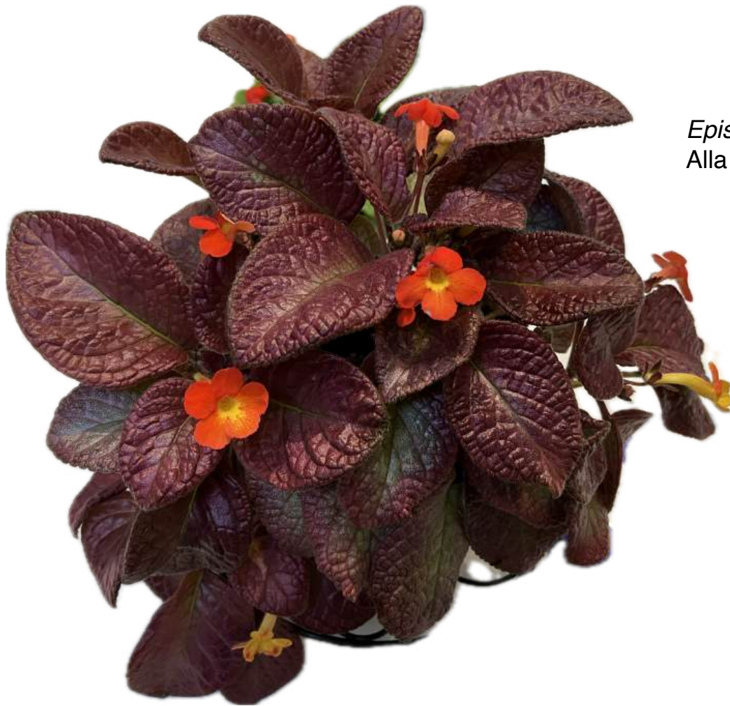
Episcia 'Temptation' Alla Kotova