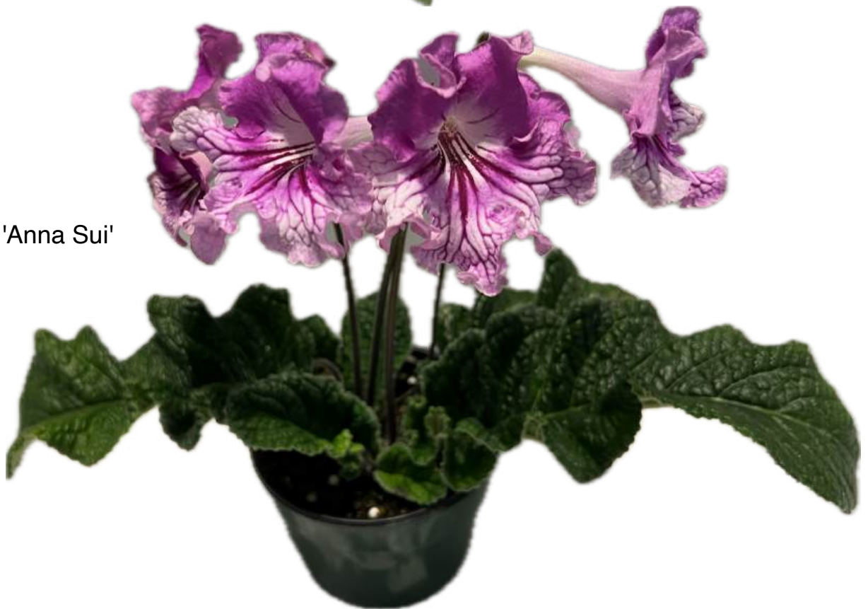
Streptocarpus 'Anna Sui'