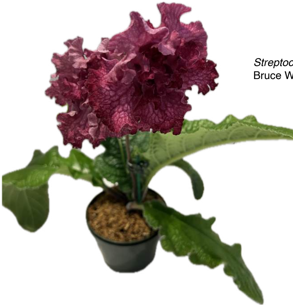
Streptocarpus 'Eternity' Bruce Williams