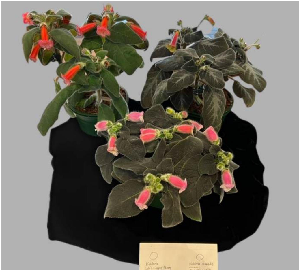
Kohleria amabilis var. bogotensis