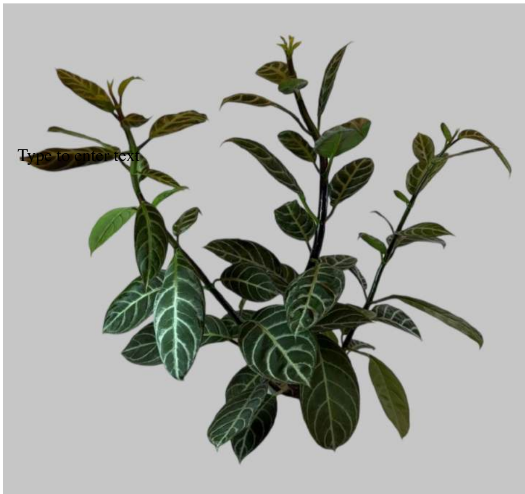
Drymonia chiribogana