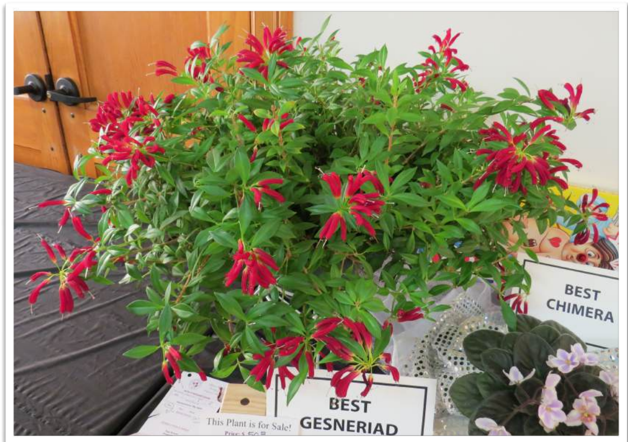
Aeschynanthus 'Big Apple' Best Gesneriad Paul Sorano