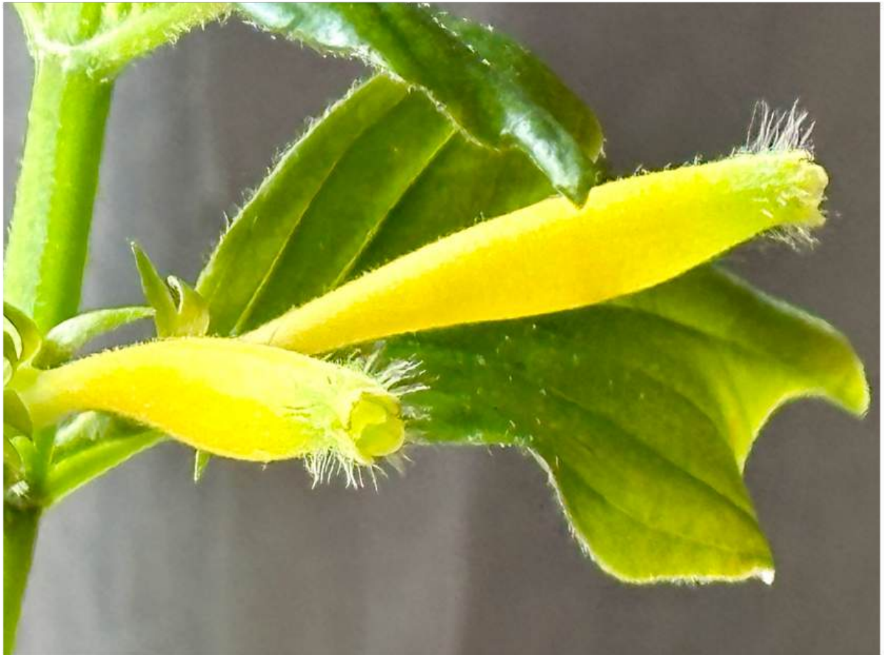
Columnea crassicaulis - Vicki Ferguson

" Amalophyllon clarkii is a gorgeous little species from Ecuador. While the tiny white blooms are fleeting, those stunning dark-veined leaves steal the show year-round. This one's a true gem for gesneriad collectors who appreciate foliage as much as flowers!"