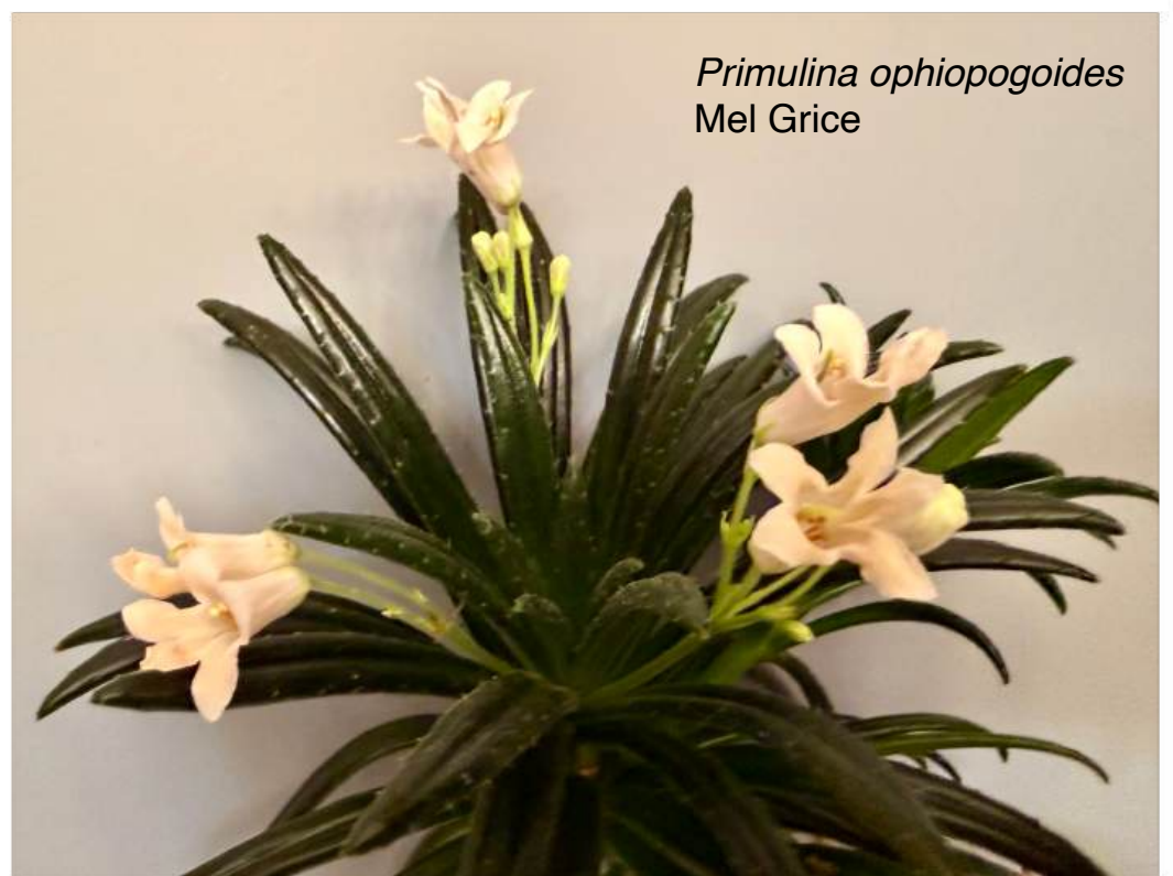
Primulina ophiopogoides Mel Grice