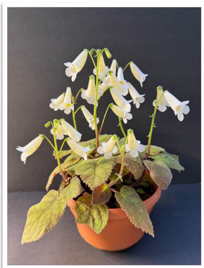
Smithiantha (possibly multiflora?) Barb Borleske