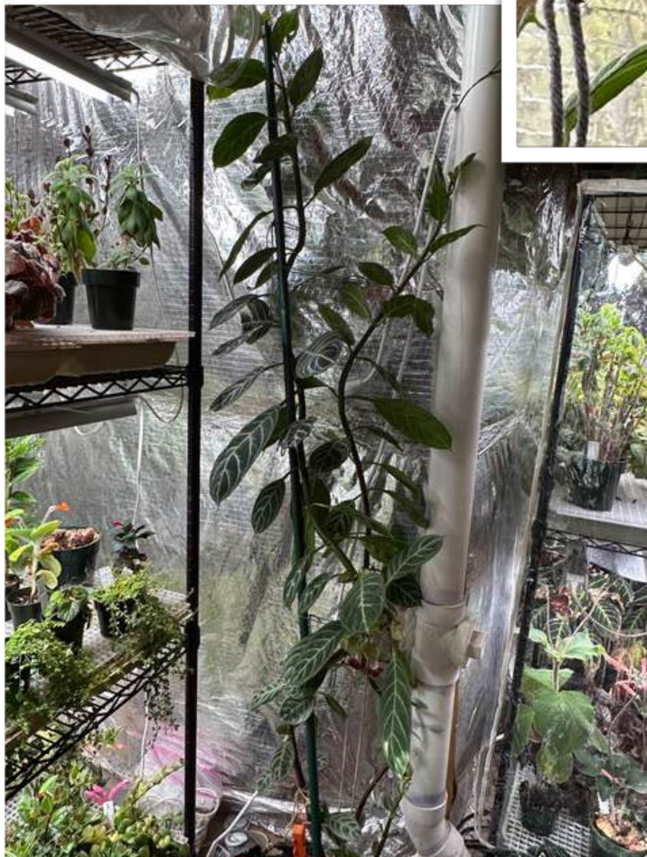
Drymonia chiribogana