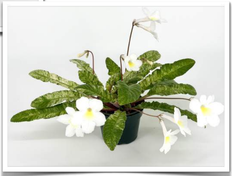
Streptocarpus 'Dale's Polar Blizzard' Brett Flewelling