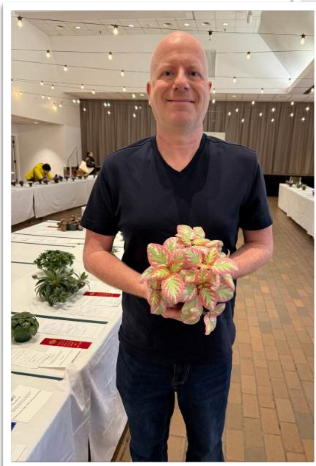
Episcia 'Unpredictable Valley' Brett Flewelling