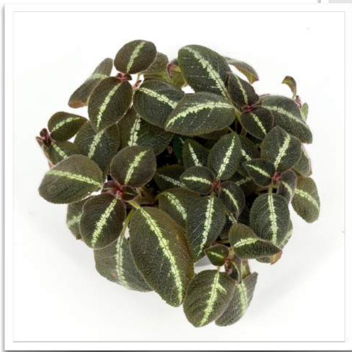
Episcia 'La Solidar Bronze' Brett Flewelling