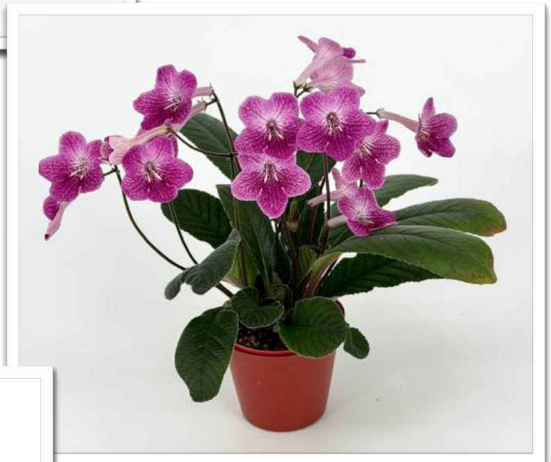
Streptocarpus 'Ladyslipper Strawberry Ice' Irina Firer