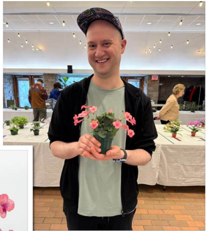
Sinningia 'Malu's Rockin' Robin'