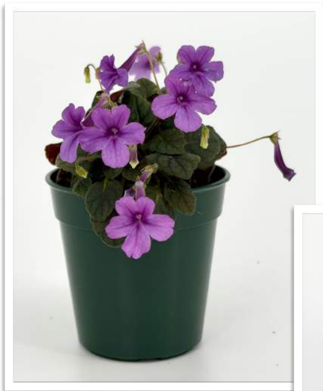
Sinningia 'JDP Purple Pahaad' Sheila Jones